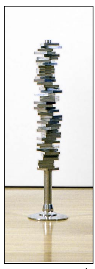
Figure 3. Colonne nº 6, 1967.

In teaching, as I know from some unhappy experience with early efforts to use technology, there is also a great danger of allowing technique to overwhelm the purpose for which it is deployed. If one spends more time putting bells and whistles into PowerPoint presentations than in mapping out learning outcomes for a class, a danger sign should start flashing. And unless you teach engineering, computer